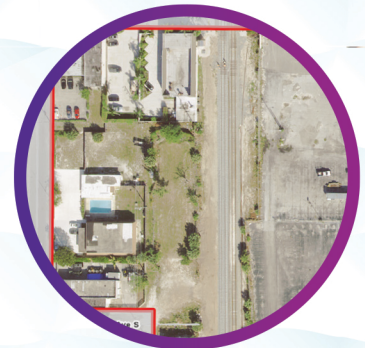
Site 2- page 8