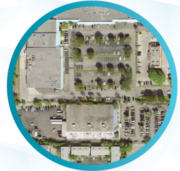
Site 1- page 4

Created 6/1/2008