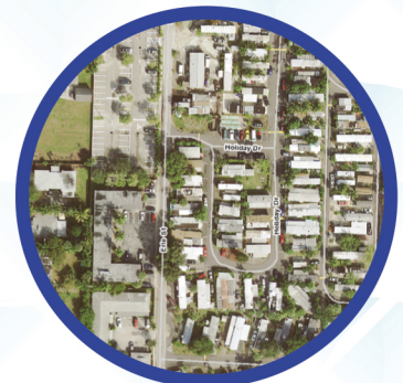
Site 3- page 12